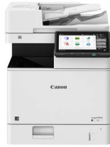
imageFORCE 710F* (Non-Finisher Model)