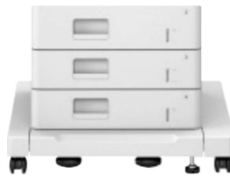
CASSETTE FEEDING UNIT-AX1