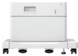
CASSETTE FEEDING UNIT-AR1