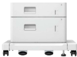
HIGH CAPACITY CASSETTE FEEDING UNIT-D1